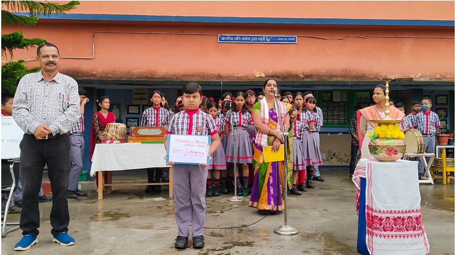
Some moments Captured ...