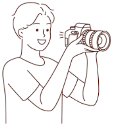
Some moments Captured